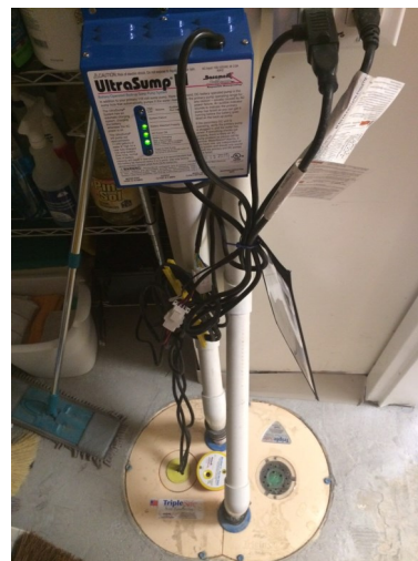
One of the two sump pumps that's been installed.

Thank you to everyone who sacrificially gave to meet this need.