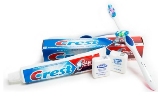
Dental Hygiene Items February